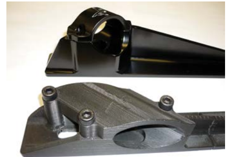
The seat mount prototype compared to the final end-use part.