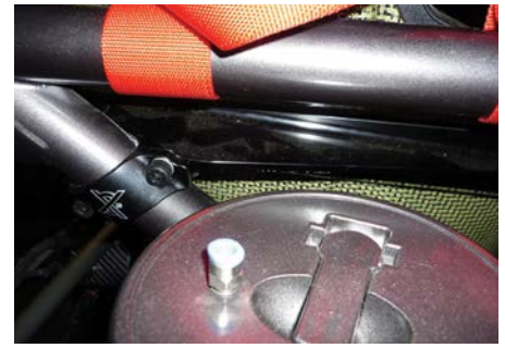
Triple Eight 3D printed the prototype of this seat mount in the racing car.

This strategy is a winning one for Triple Eight Race Engineering now and into the future. They have just beaten the competition at the end of 2014 and retained their championship title for the fourth consecutive year.