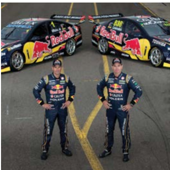
3D printing has helped propel Triple Eight Race Engineering to multiple motor racing championships.

Since its inception in 2003, Triple Eight Race Engineering has grown to become one of the largest and most successful motor racing teams in Australia. The team has dominated the country’s premier motorsport, winning the V8 Supercars Championship six times – an international touring car racing championship that draws crowds of over 150,000 spectators and several million TV viewers. They also won the Bathurst 1000 – Australia’s version of Le Mans – five times.