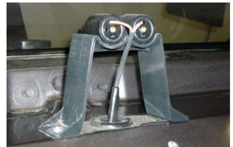
This brake light mount end-use part was also created on the Dimension 3D Printer.